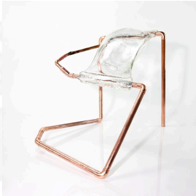
Image: Romina Gonzales Downward, Vow , glass, copper, stainless steel, HXTAL NYL-1 epoxy, 28 x 20 x 22 in., 2022