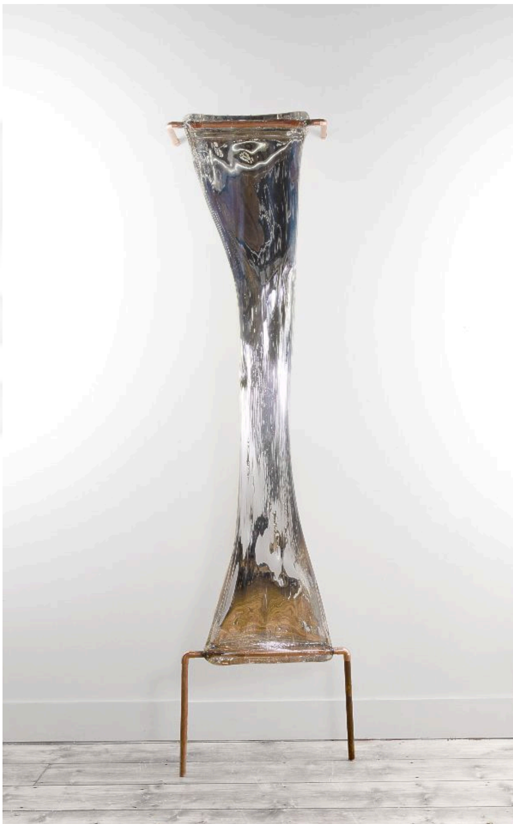
Image: Romina Gonzales, I am , glass, silver nitrate, copper, stainless steel, HXTAL NYL-1 epoxy, 22 x 6 x 87 in., 2022