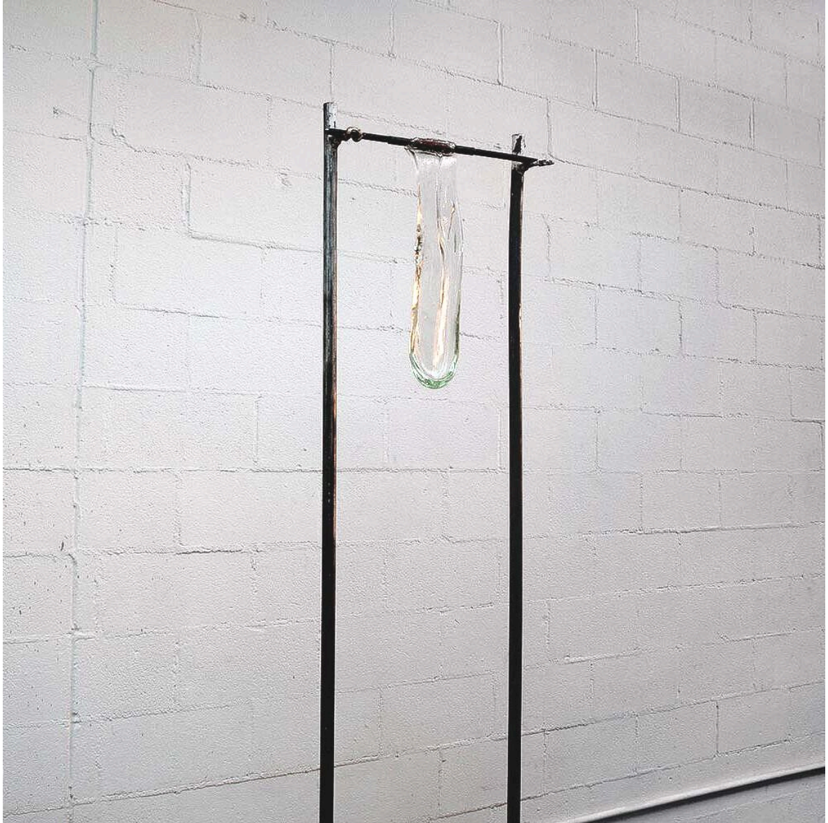
Image: Romina Gonzales, Little Pull-Cynthia , glass, copper, steel, 48 x 4 x 96 in, 2019