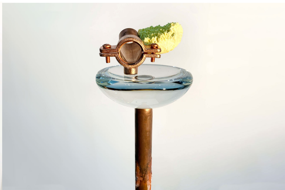
Image: Romina Gonzales, The Return , glass, copper, sulfur, steel, epoxy, 4 x 4 x 25 in., 2022

233 LIBERTY ST, NEWBURGH, NY 12550 Press Contact: attila.king@visitorcenter.space