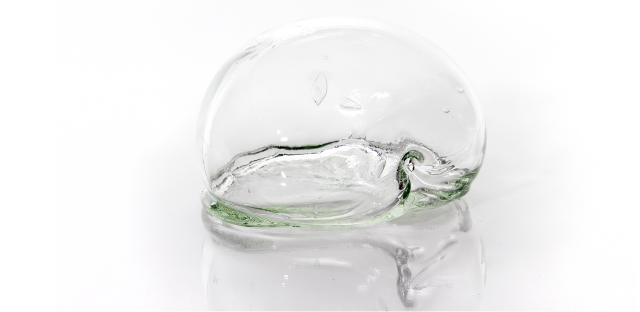
Image: Romina Gonzales , Rain Guardian II , glass, HXTAL NYL-1 epoxy , 10 x 10 x 7 in., 2019