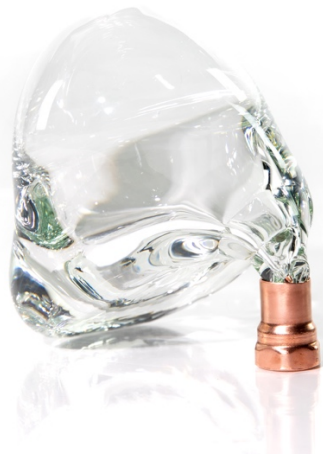
Image: Romina Gonzales, Deep Breath , glass, copper, HXTAL NYL-1 epoxy, 6.5 x 5 x 7 in., 2022