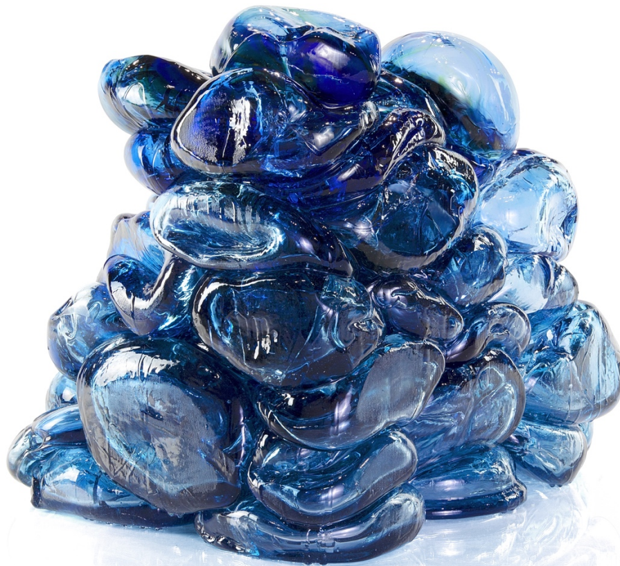
Image: Romina Gonzales, A Mound, a Corner or a Grotto , glass, HXTAL NYL-1 epoxy, 22 x 20 x 17 in., 2019